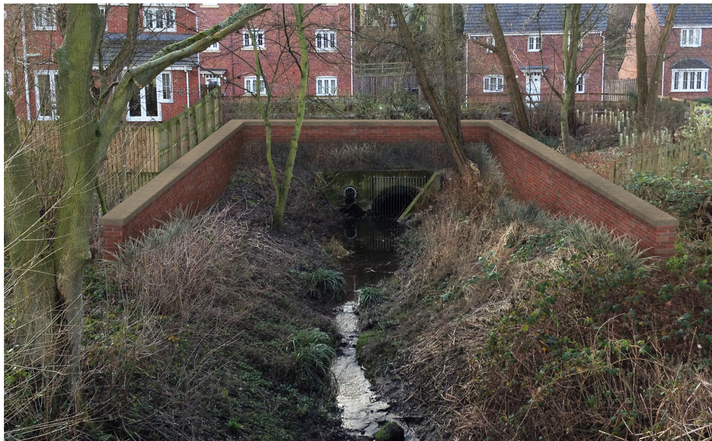
01 - ARTISTS IMPRESSION