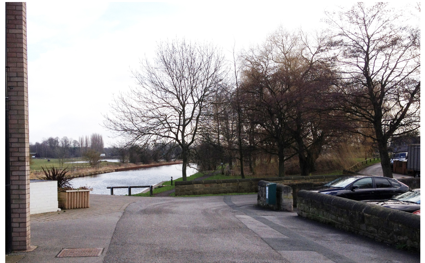
02 - ARTISTS IMPRESSION